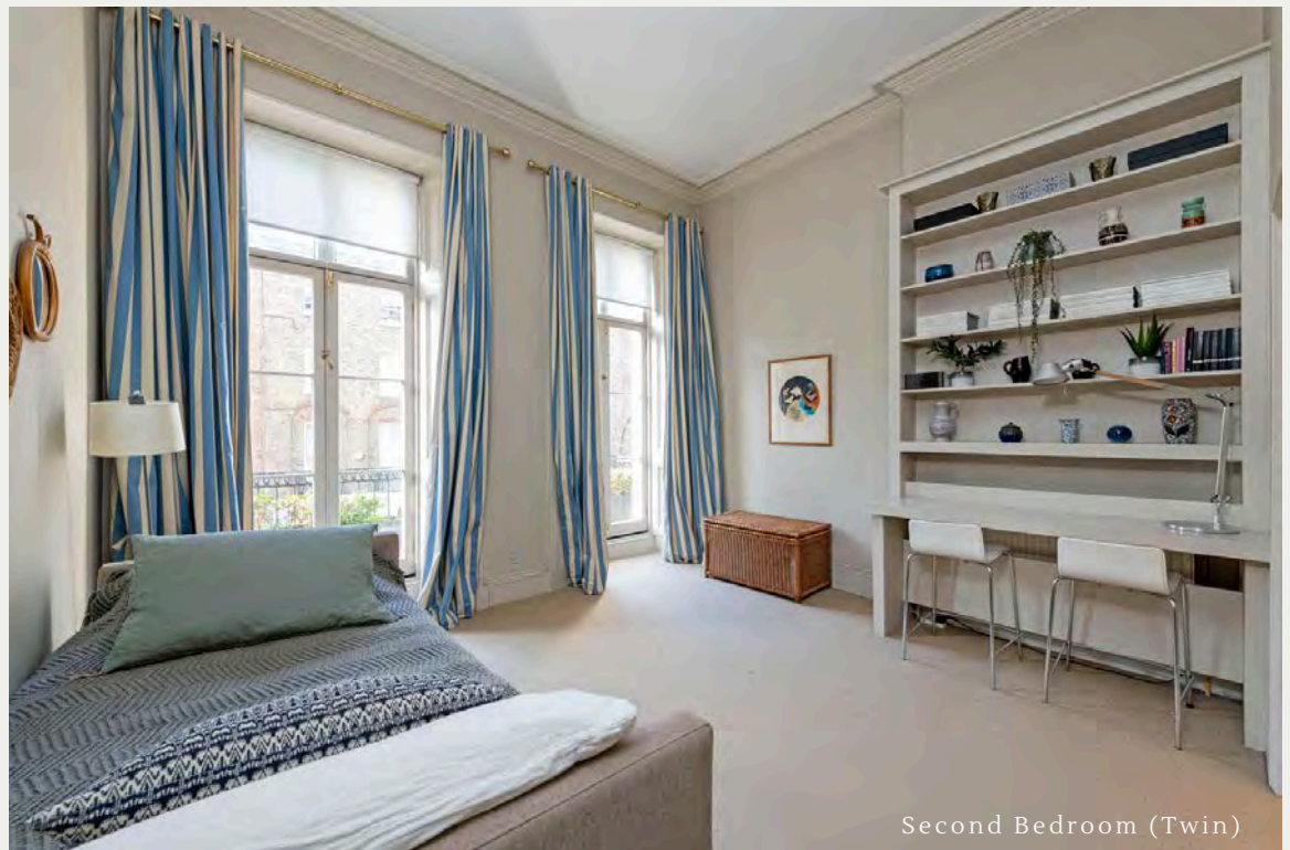
Second Bedroom (Twin)