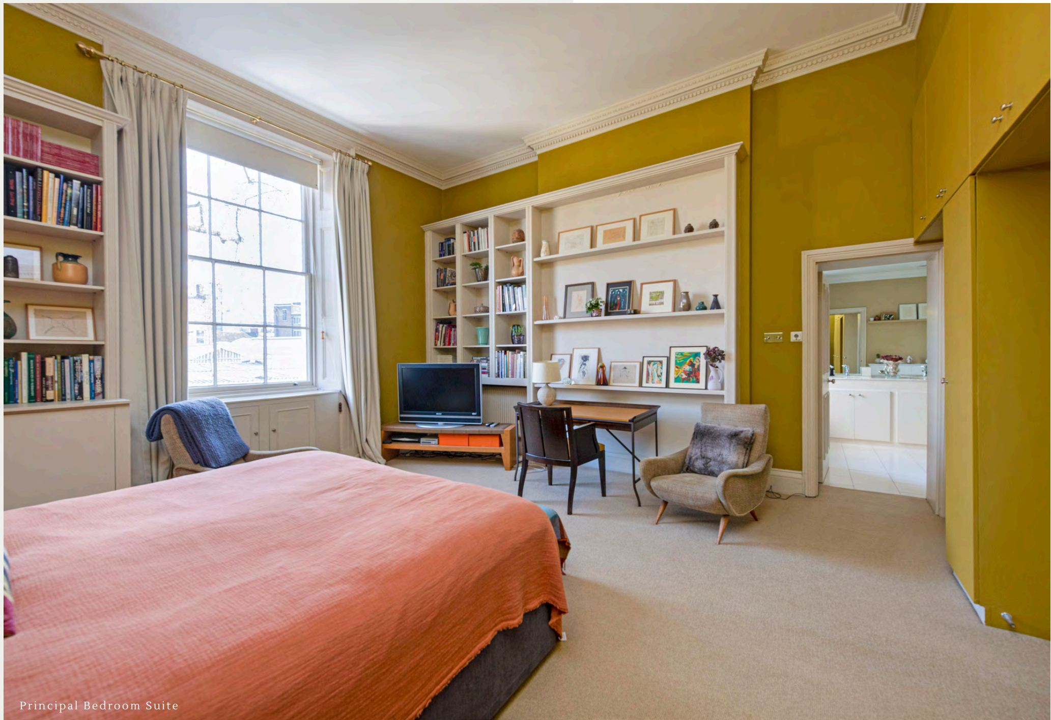
Principal Bedroom Suite