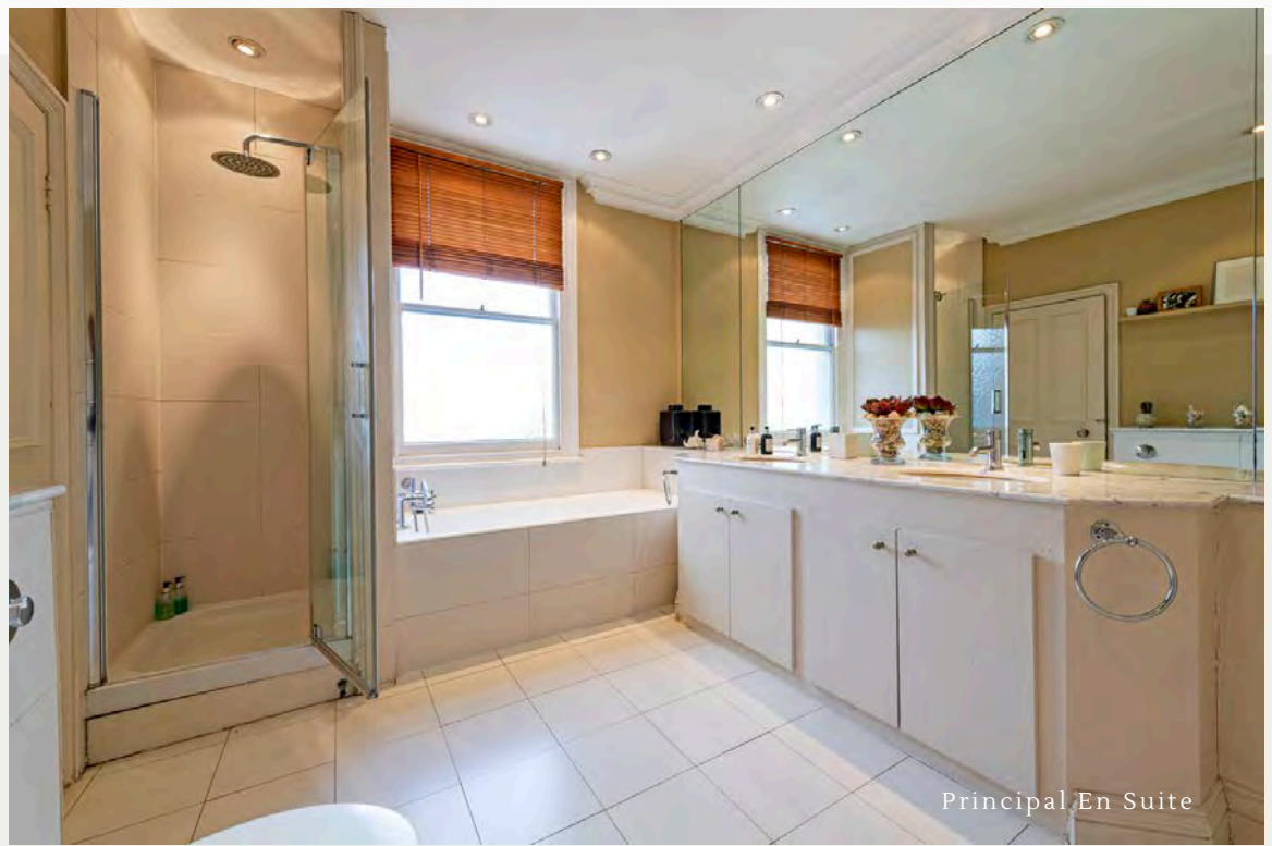
Principal En Suite