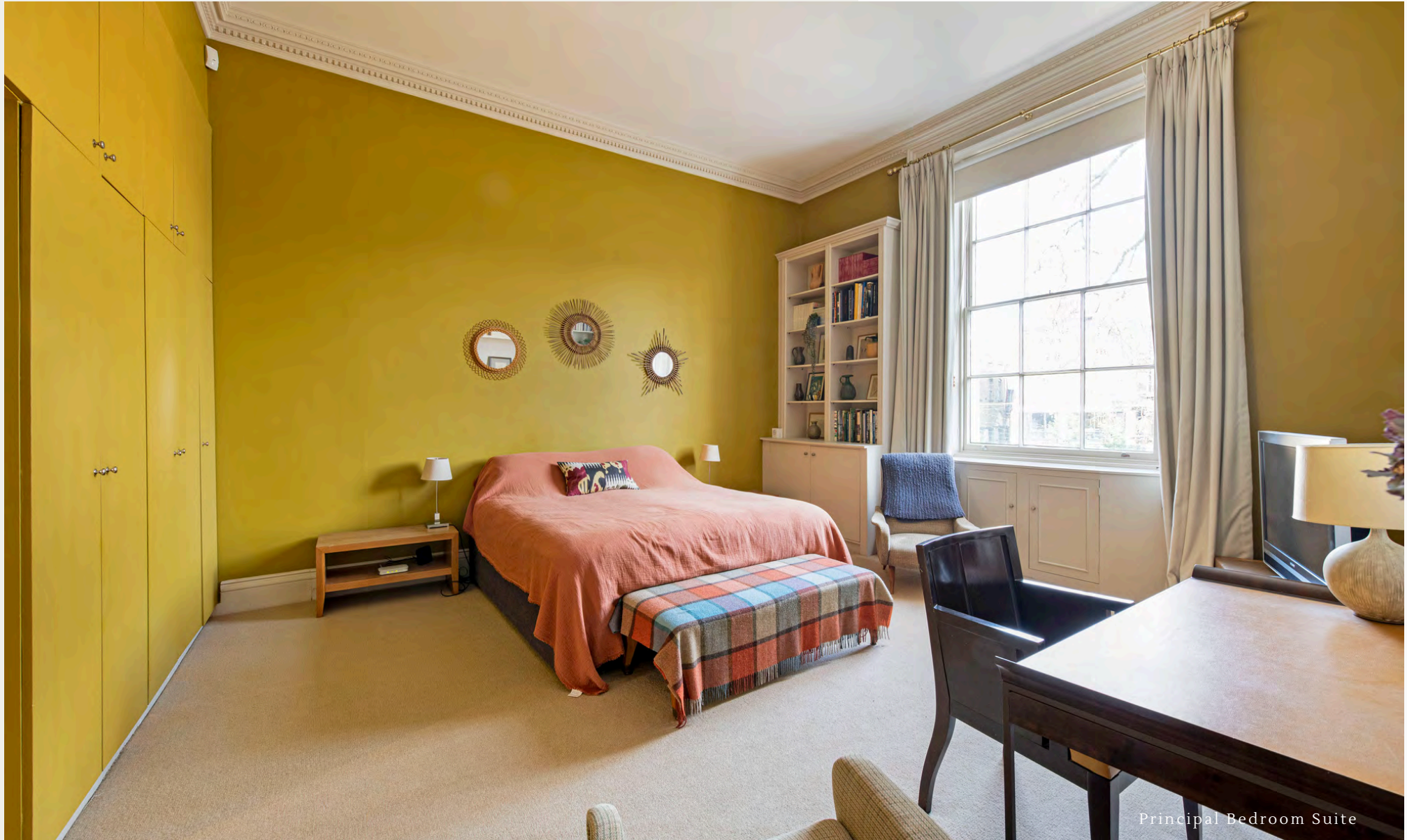
Principal Bedroom Suite

There are 3 bedrooms in total including a Principal Suite, Twin Room and a Single Room. There are two En Suites and a guest cloakroom and each bedroom is complete with floor to ceiling built in storage space, a huge bonus for a Central London property.