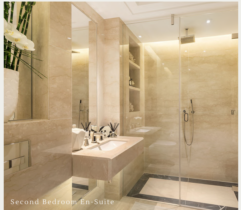
Second Bedroom En-Suite