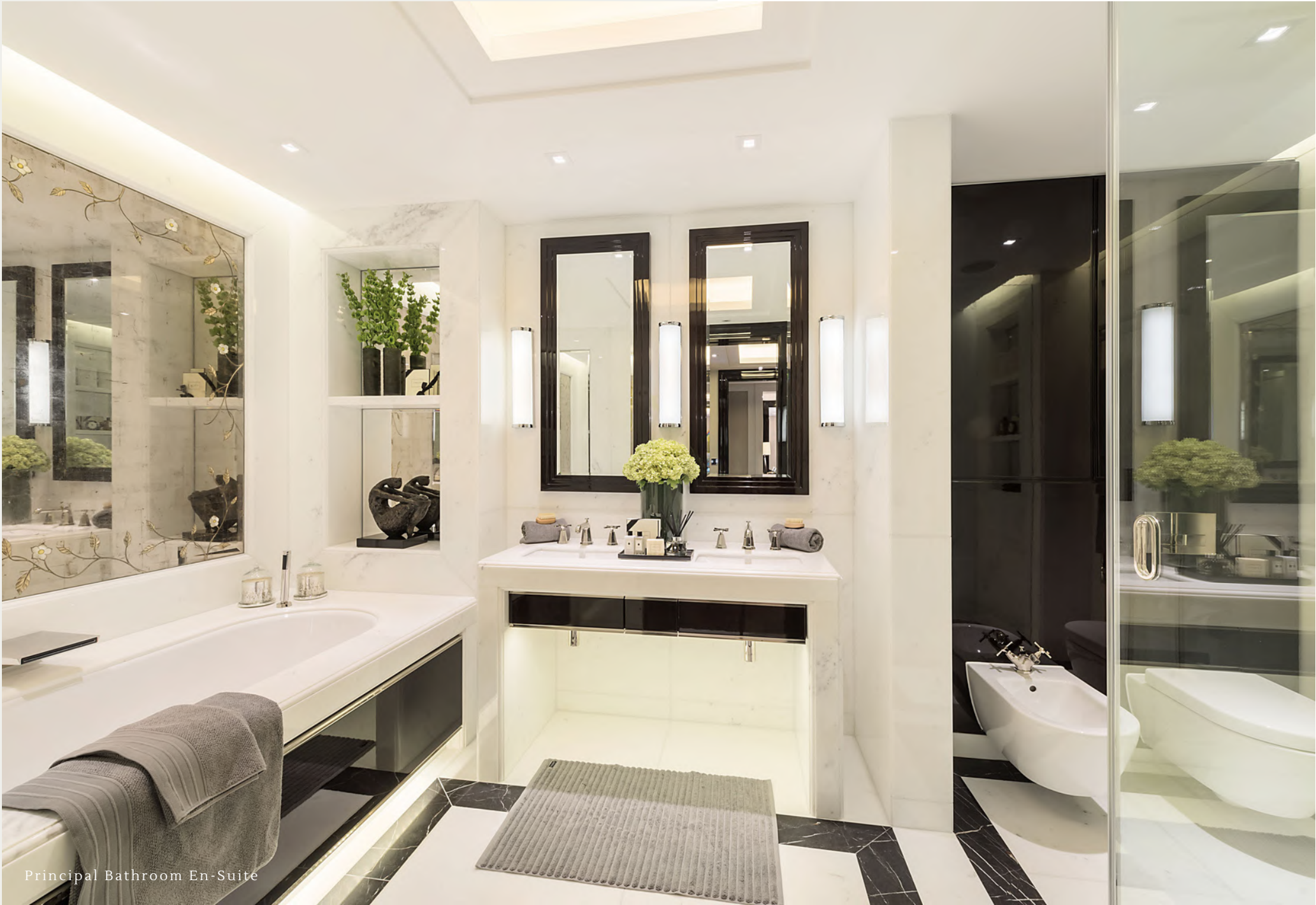
Principal Bathroom En-Suite