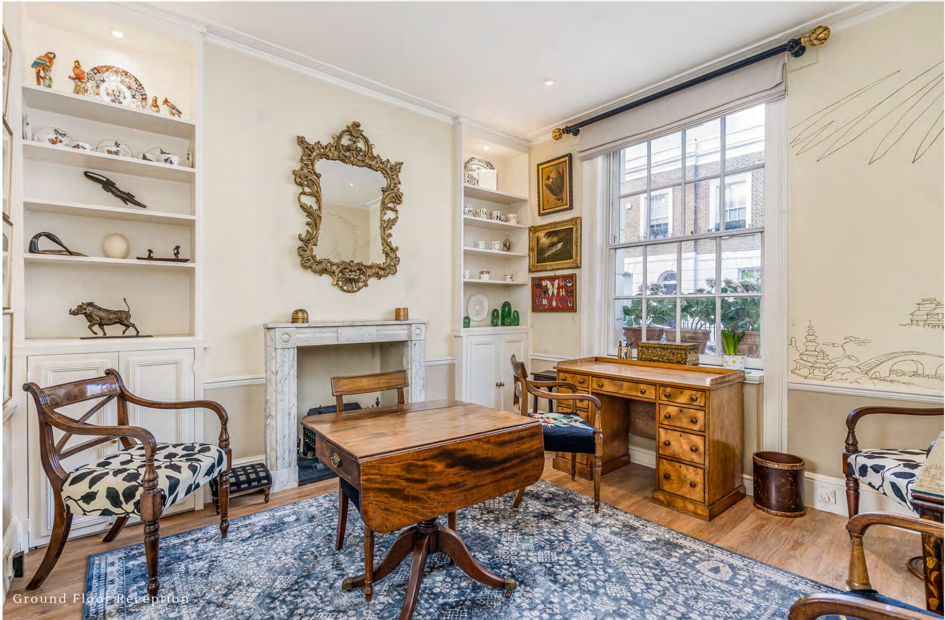
Ground Floor Reception