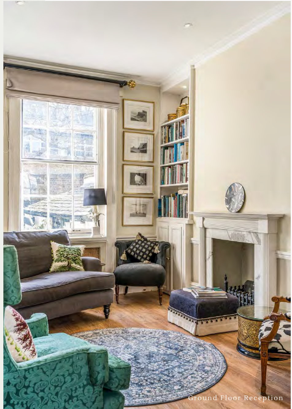
Ground Floor Reception