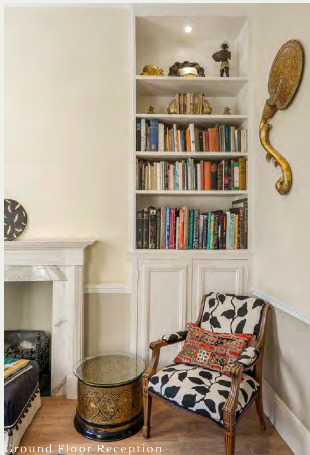
Ground Floor Reception

The Raised Ground Floor is dedicated to a stunning, spacious Double Reception/Dining Room. Spanning from the front of the house all the way through to the rear, the space is flooded with natural light and offers ample space for relaxing and entertaining.