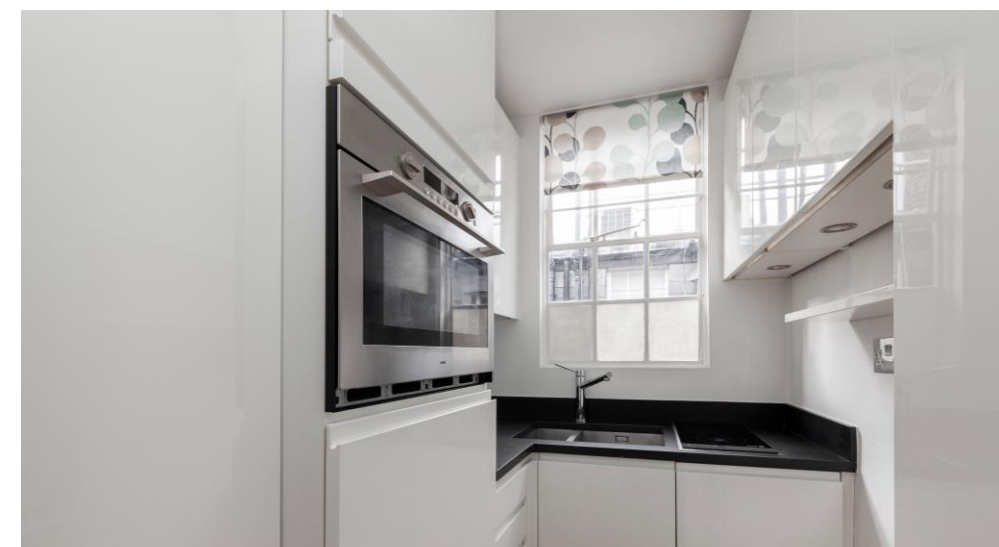
This charming one bedroom apartment is located on the 6th floor of this secure building in the heart of Mayfair. The apartment is within close proximity to all the shops, bars and restaurants that Mayfair has to offer. Grosvenor Street is located between three underground stations; Bond Street Station, Oxford Circus Station and 0.5 miles to Green Park Station.