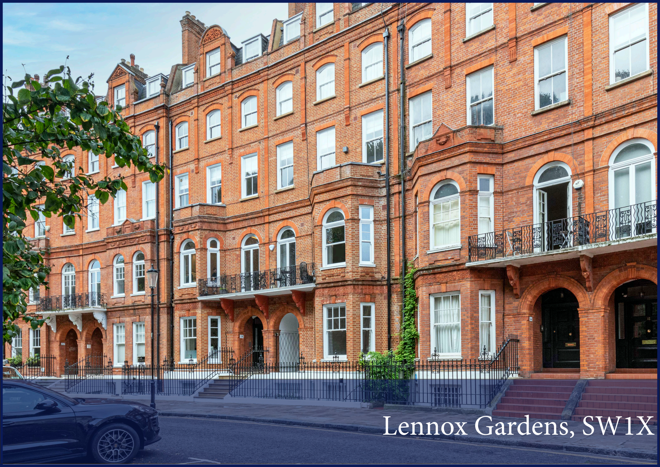
Lennox Gardens, SW1X